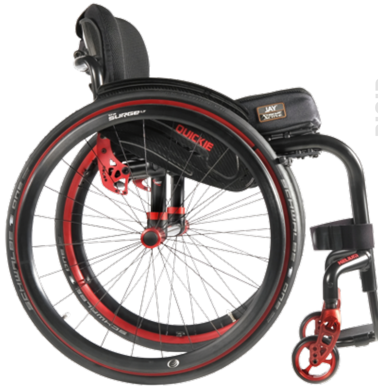
XENON 2 from 8,8 kg